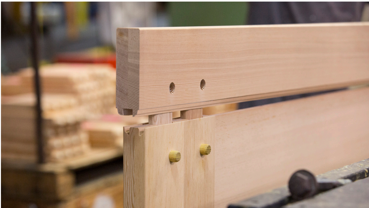
Stiles and Rails coming together