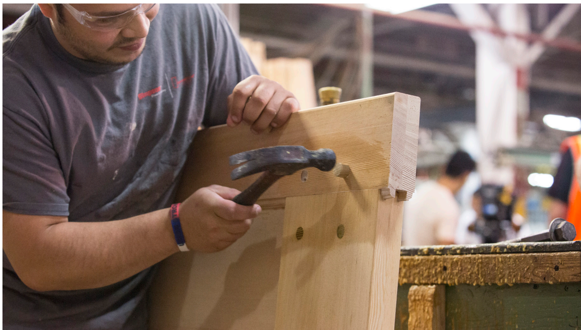
Hammering in Face Pin

A wood pin is driven into the face of the door to join the components together. The result is a unique beauty and durability that is only found in the Nantucket® collection.