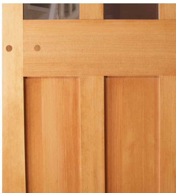
Door with Flat Panel, shown with Shaker Sticking

In addition to advanced durability they have exquisite detail and feature a flat or double hip raised panel and have the choice to include a variety of glass options.