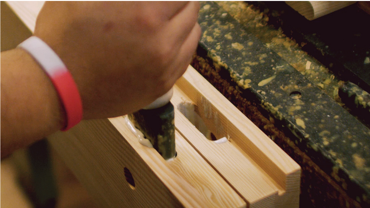
Adding glue to Mortise