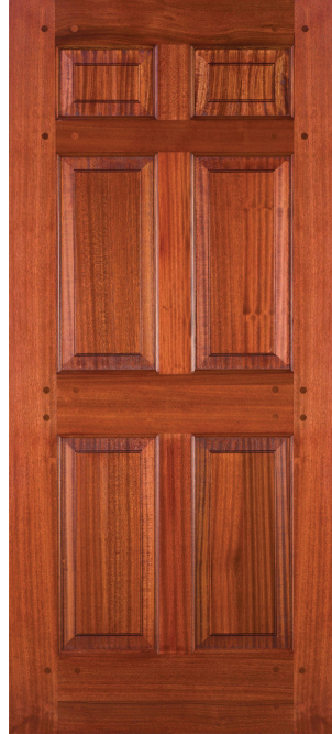
Sapele Mahogany door

Nantucket doors feature unmatched character that can only be found in real wood and will retain their rugged beauty and last for years, regardless of what nature sends their way.