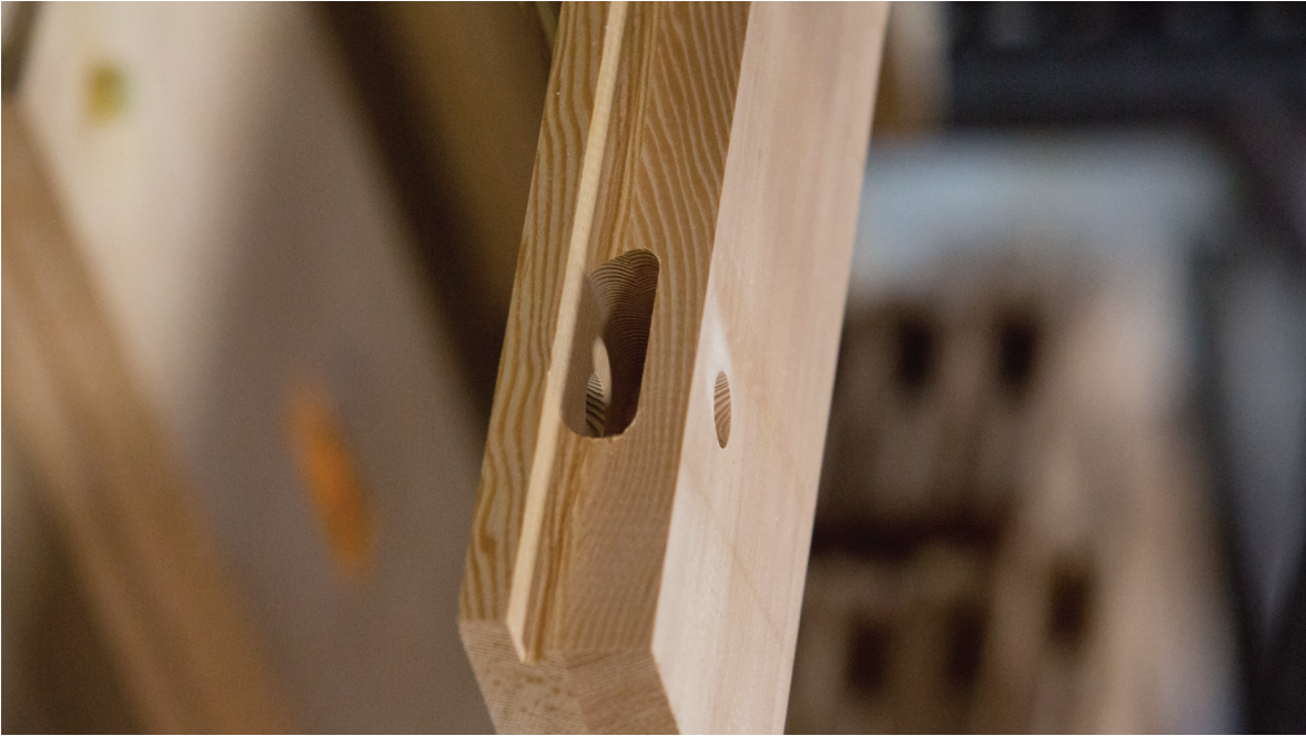
Mortise cut into Stile

The Nantucket® door is joined with a modified mortise-and-tenon. A large mortise is cut into both the stile and rail. Glue is added to the mortise of the stile and a tenon is inserted.