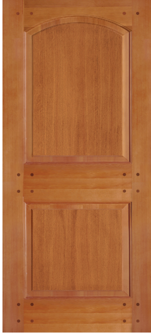
Douglas Fir door

Made from wood that is naturally moisture-resistant Nantucket® doors are available in 2 species: Douglas Fir and Sapele Mahogany. They feature a 10 year limited warranty and can be used in any exposure with no overhang required.