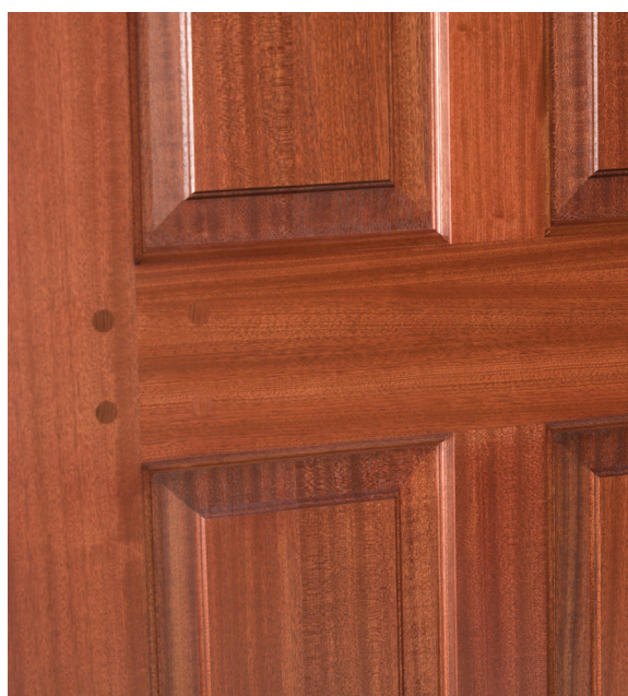
Door with Raised Panel, shown with Ovolo Sticking