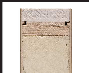
1. Top and Bottom Rails are composite for edge to edge protection. Top Rail includes LVL reinforcement for rigidity.