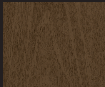
3. Fiberglass Door Skin