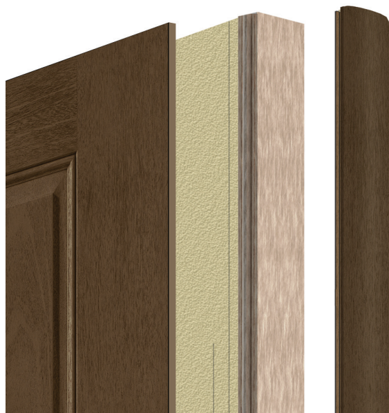
Traditional LVL Stile

Tru-Guard adds a composite edge covering over the traditional LVL stile giving the same trusted performance with an additional layer of protection from the elements.