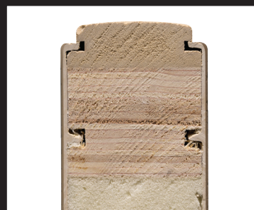
2. Tru-Guard™ Composite Engineered Stiles